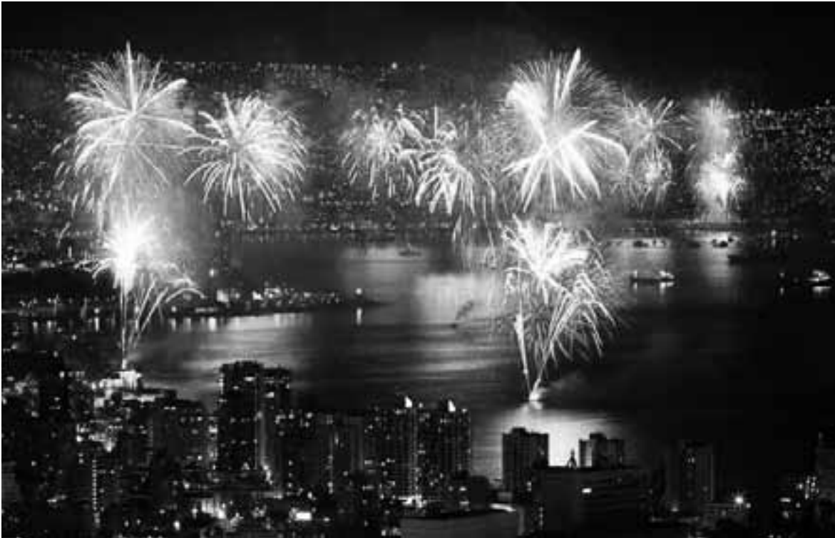
New Year's Eve Celebration- Valparaíso, Chile 2019.

Professional pyrotechnic displays are organized in different cities along the country. They are beautiful, safe and gather lots of people. These events have become a tradition in New Year's Eve. Friends and families celebrate and wish each other the best for the coming year, enjoying a spectacular show. The FIREWORKS display over the bay of Valparaíso is the most famous one, where you can see the reflection of the FIREWORKS on the sea.