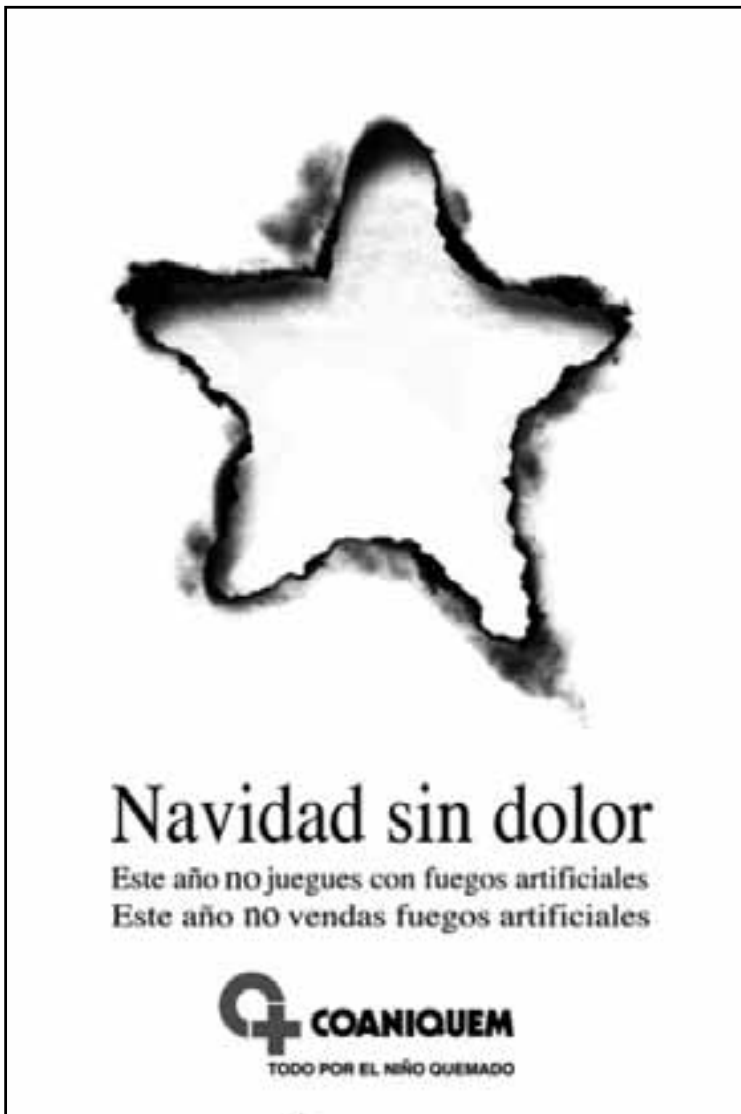
Poster of the first graphic media campaign in 1995.